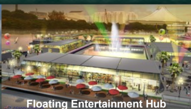
Floating Entertainment Hub